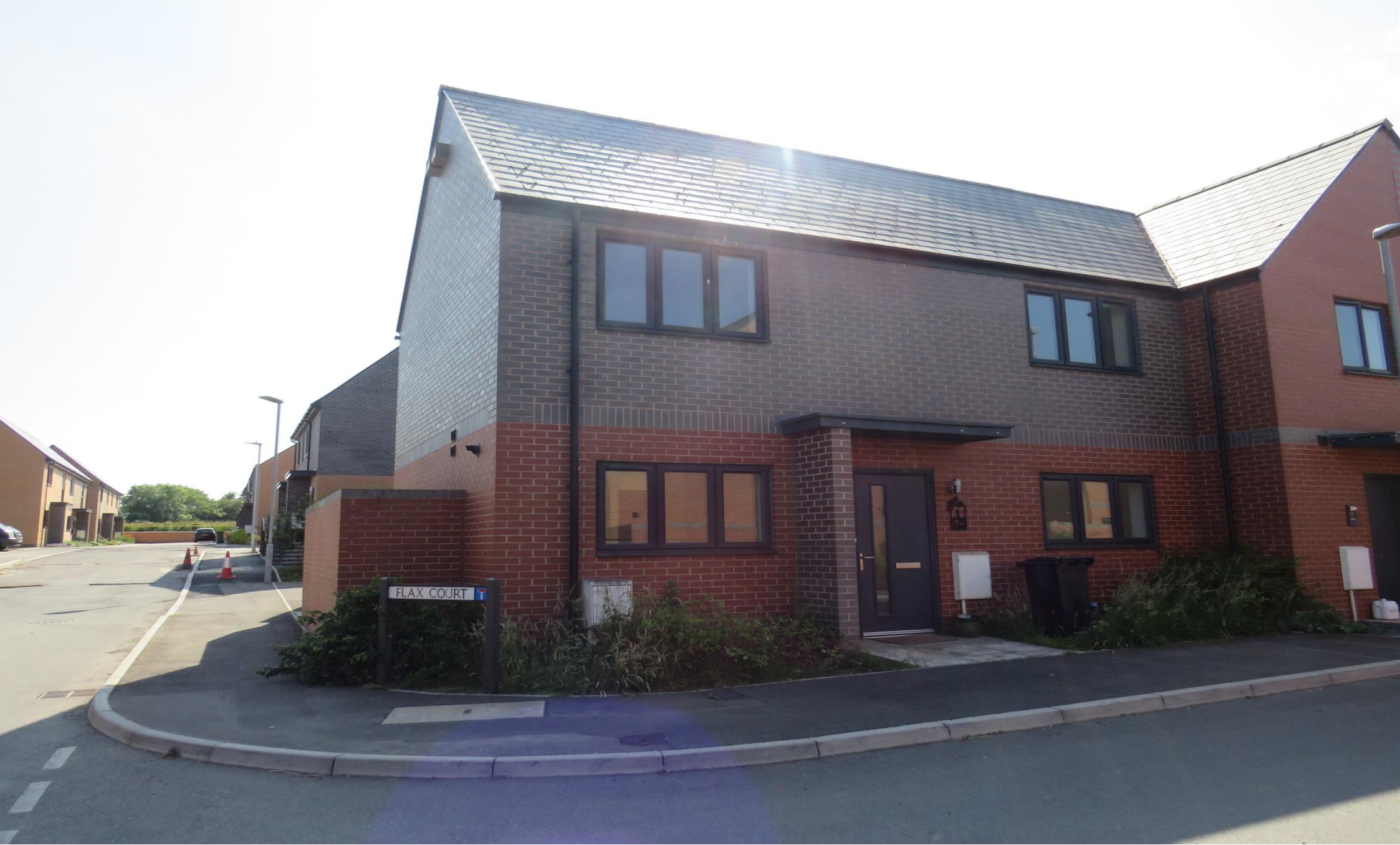
Flax Court, South Petherton TA13 5FF