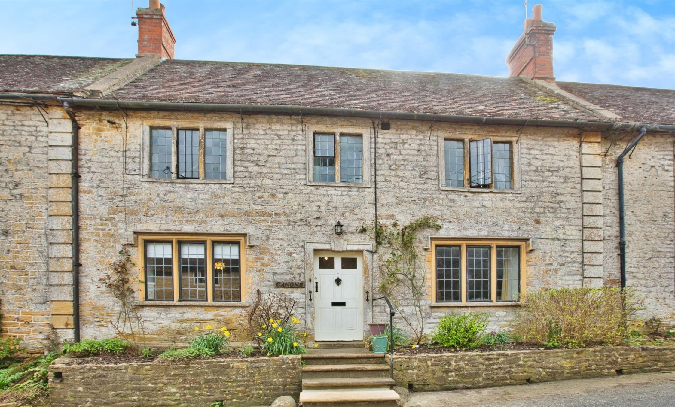
Canons Cottage, Swan Hill, Haselbury Plucknett, Crewkerne TA18 7QT