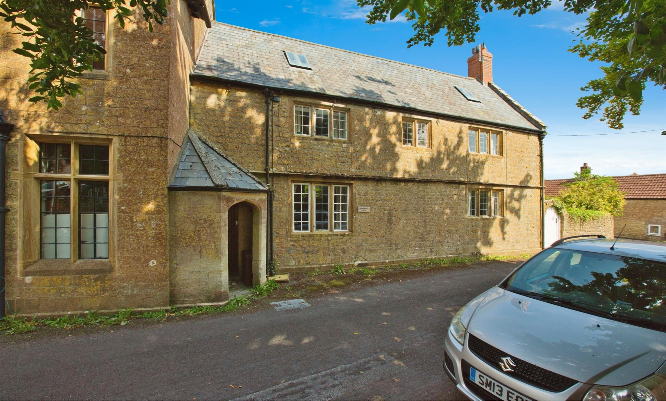
Parsonage House, Barn Street, Crewkerne TA18 8BP