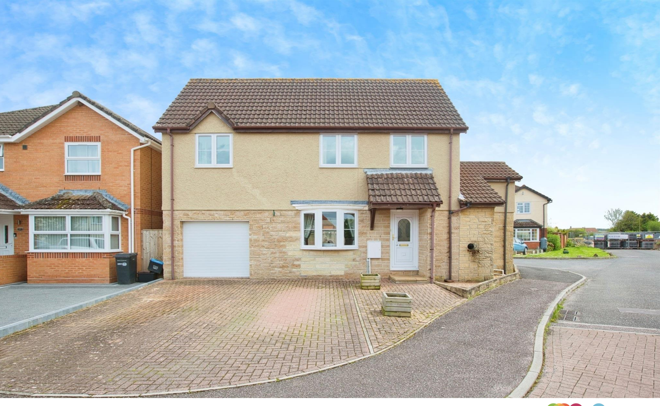
St. Peters Close, Ilton, Ilminster TA19 9HU