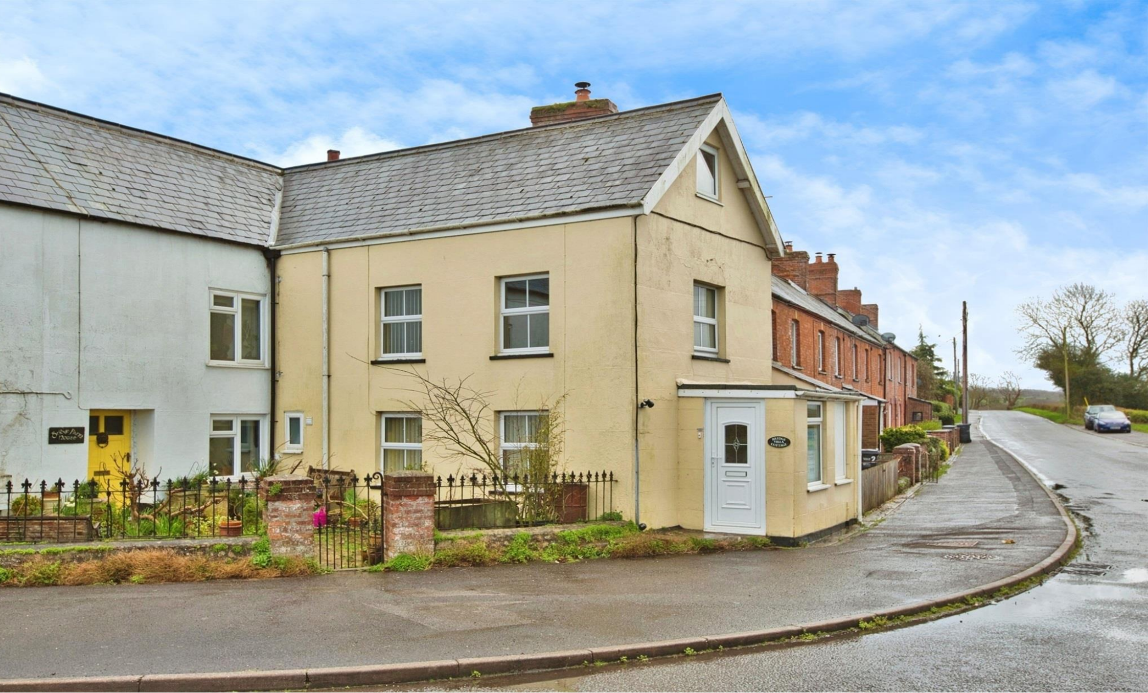
Bridge Villa Cottage, Station Road, Chard Junction, Chard TA20 4QJ