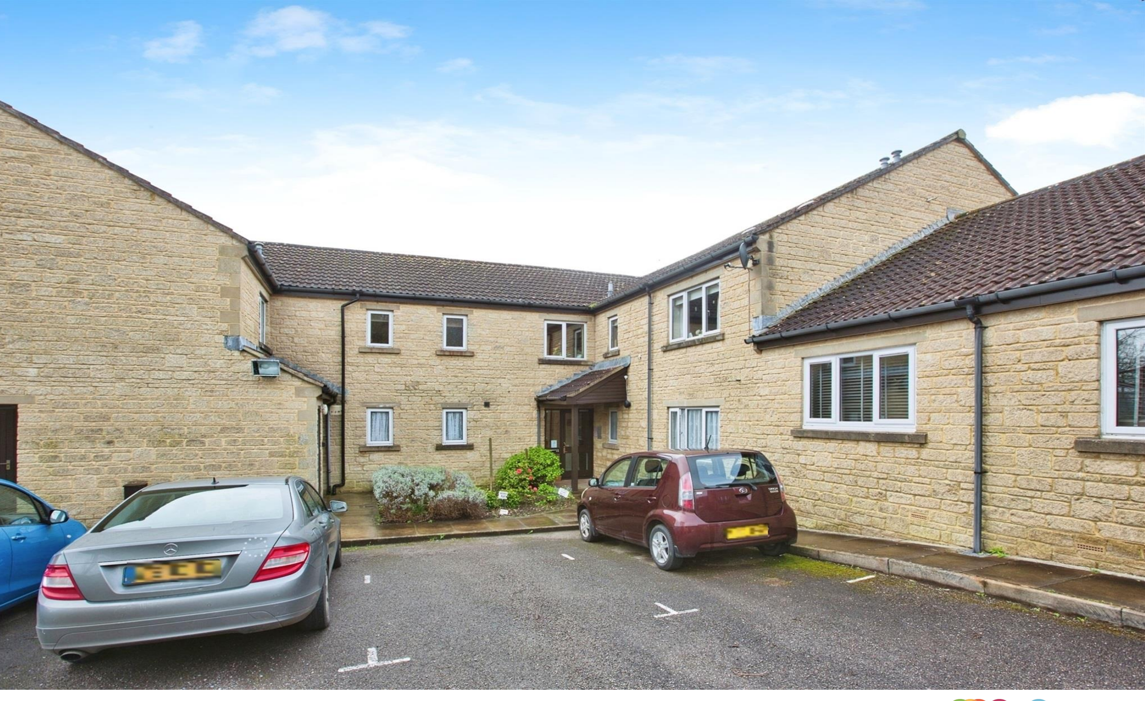
Wyvern Court, Crewkerne TA18 7DE