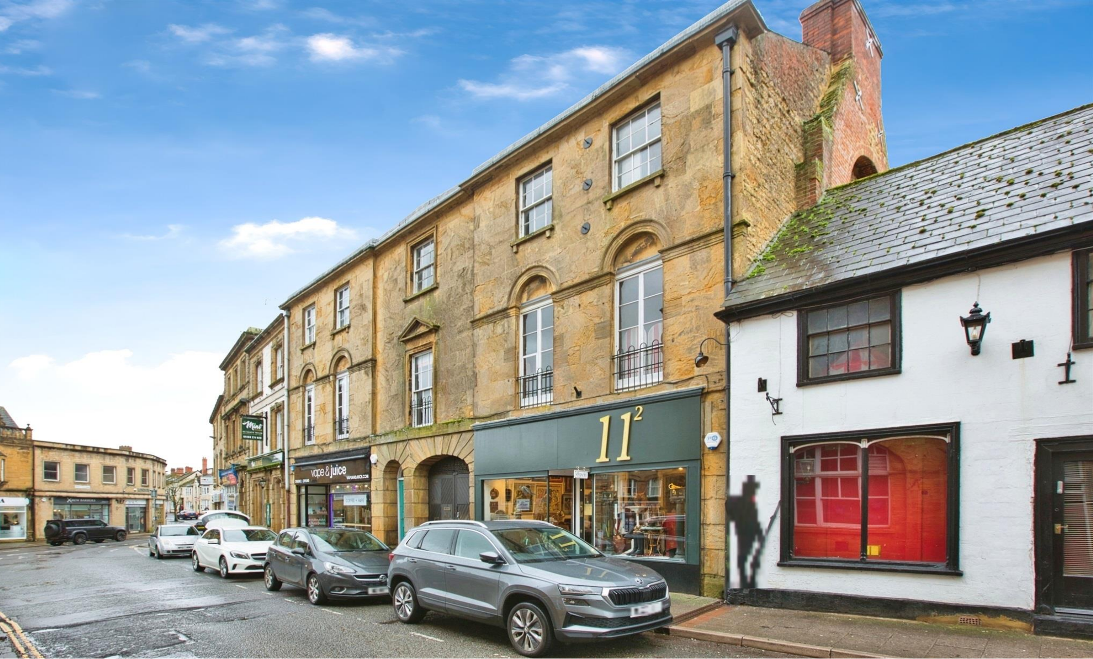
Market Court, Market Square, Crewkerne TA18 7LE