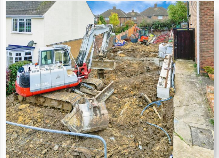
Greening Road, Rothwell Kettering NN14 6JB