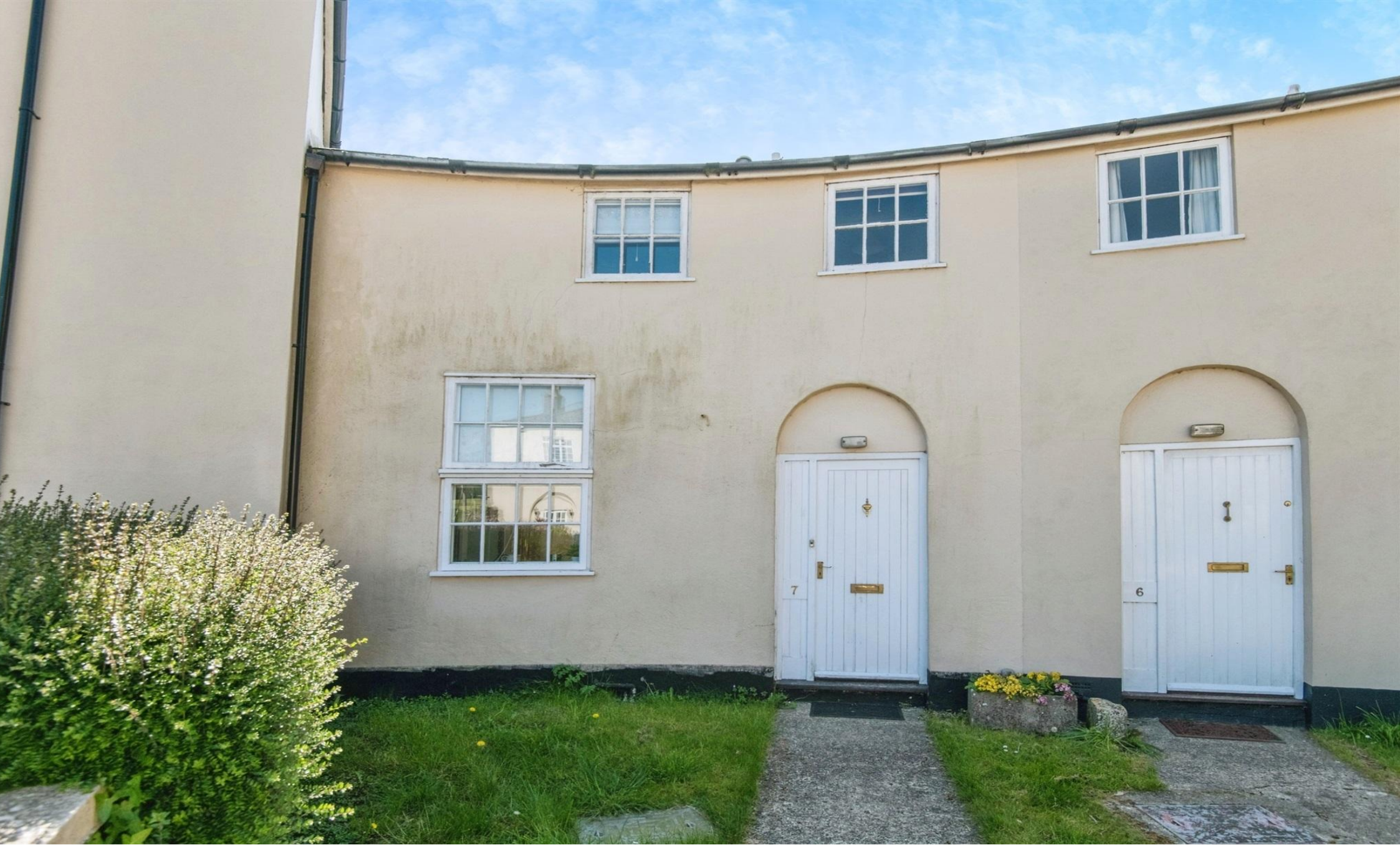
The Stables, Shute, Axminster EX13 7NY