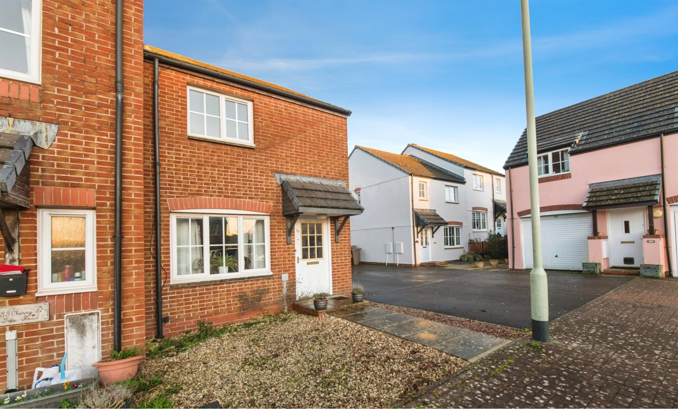
Cherry Tree Road, Axminster EX13 5GG