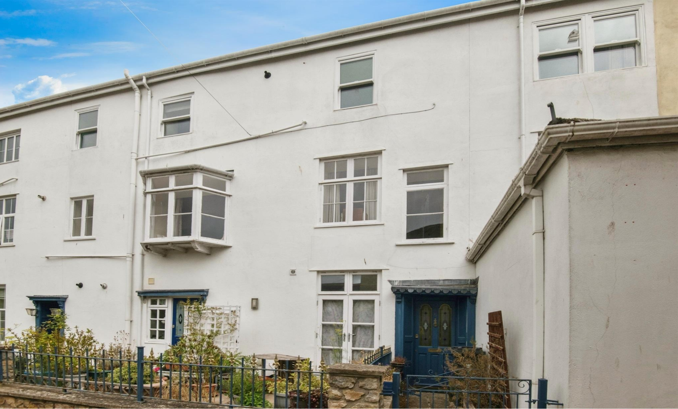
Belle Vue, West Street, Axminster EX13 5NU