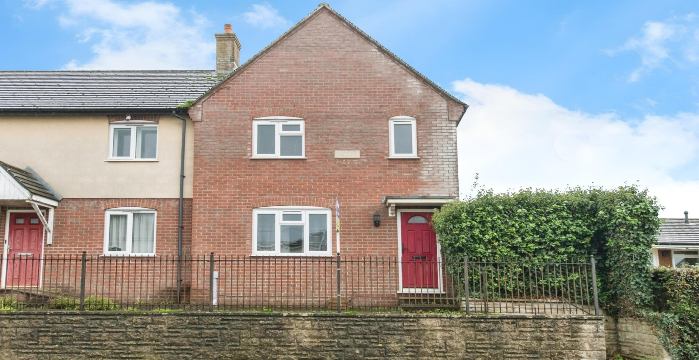
Eldridge House Chard Road, Axminster EX13 5GB