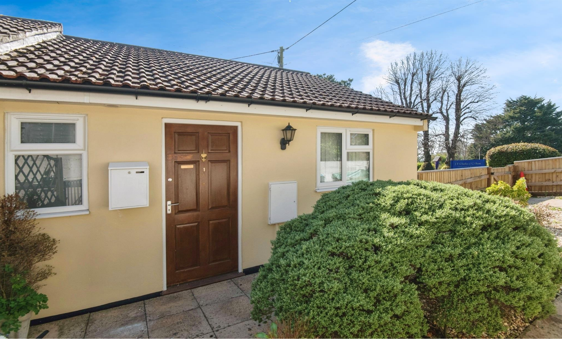
Cridlake Cottages, Lyme Road, Axminster EX13 5BE