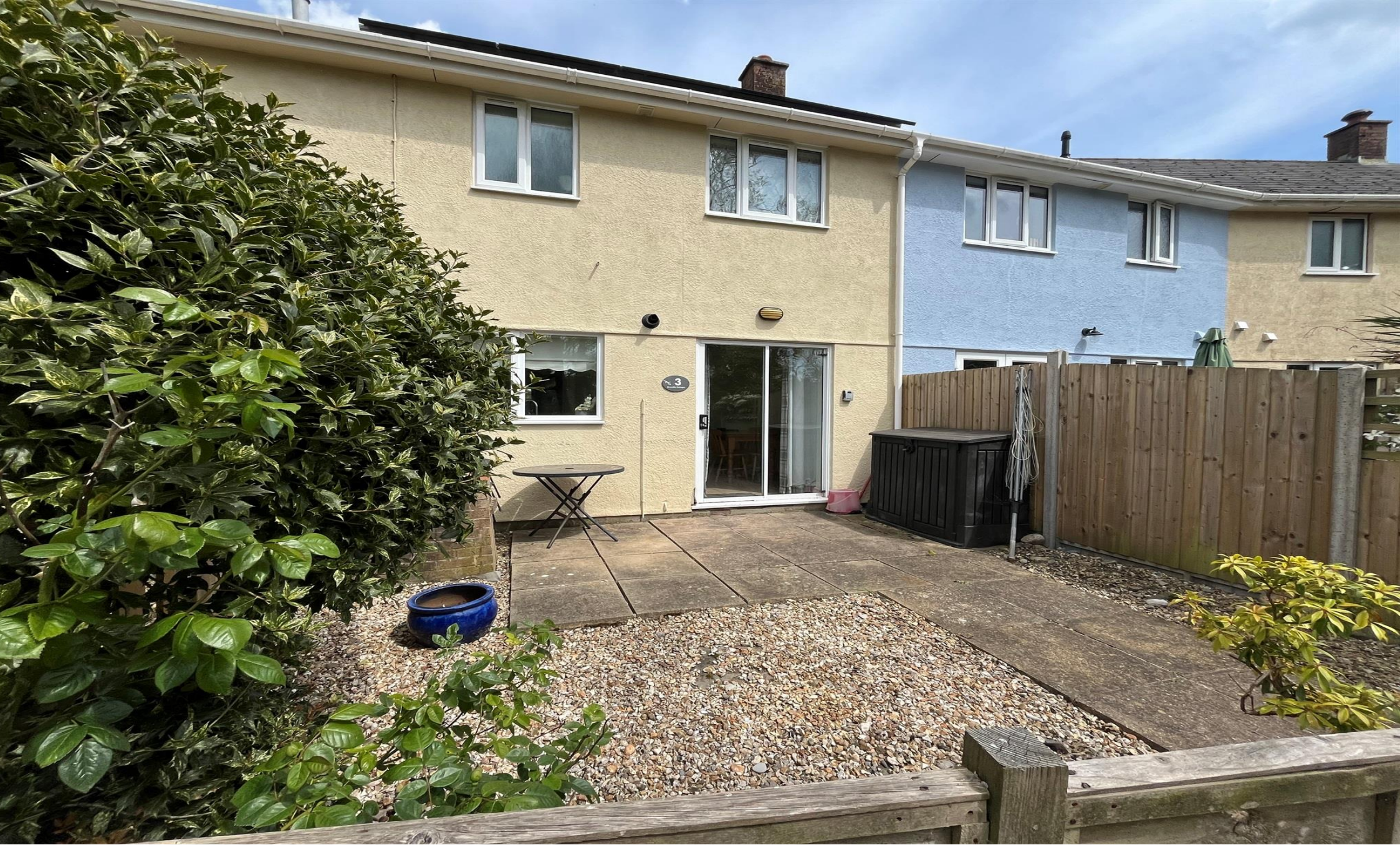
Riverside Cottages, Charmouth, Bridport DT6 6QZ