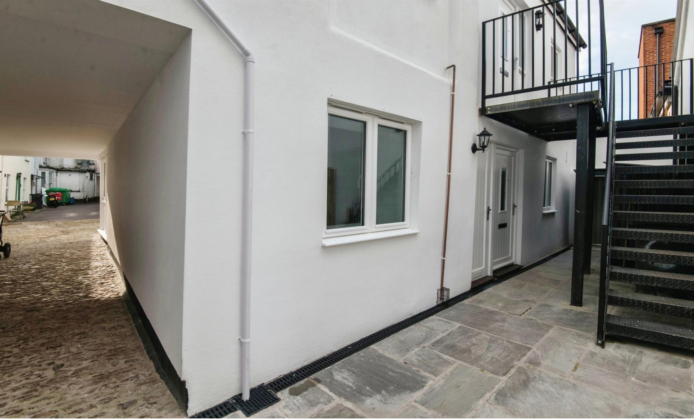
Central Place High Street, Honiton EX14 1LP