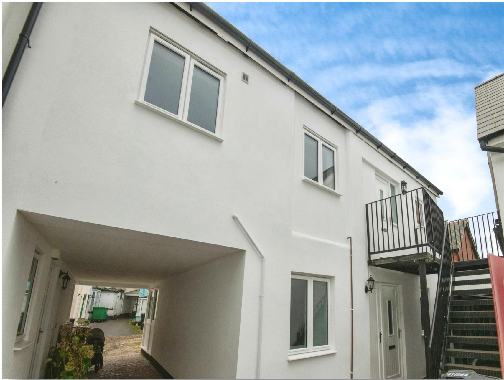
Central Place High Street, Honiton EX14 1LP