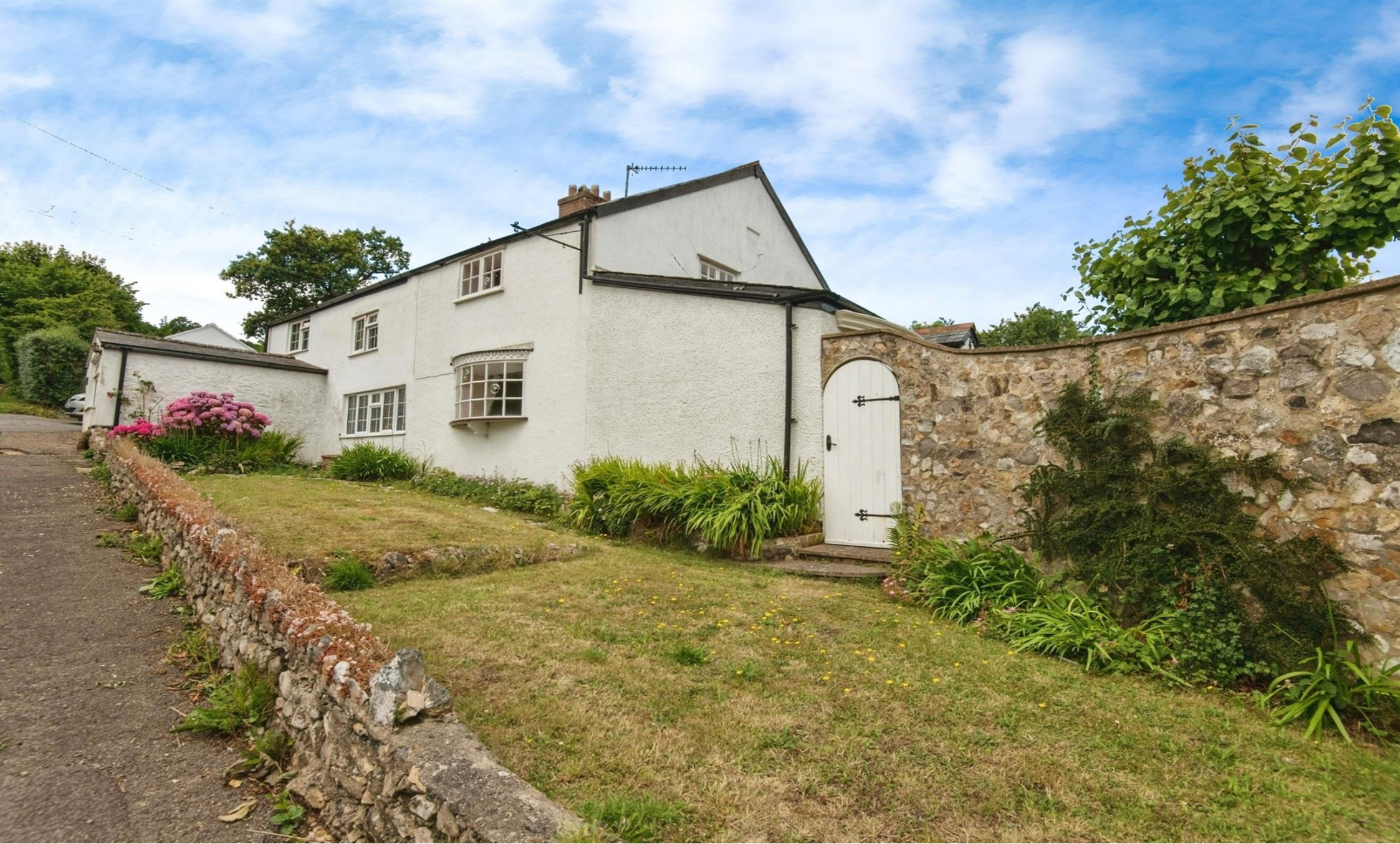
Myrtle Cottage, Fernhill, Charmouth, Bridport DT6 6BX