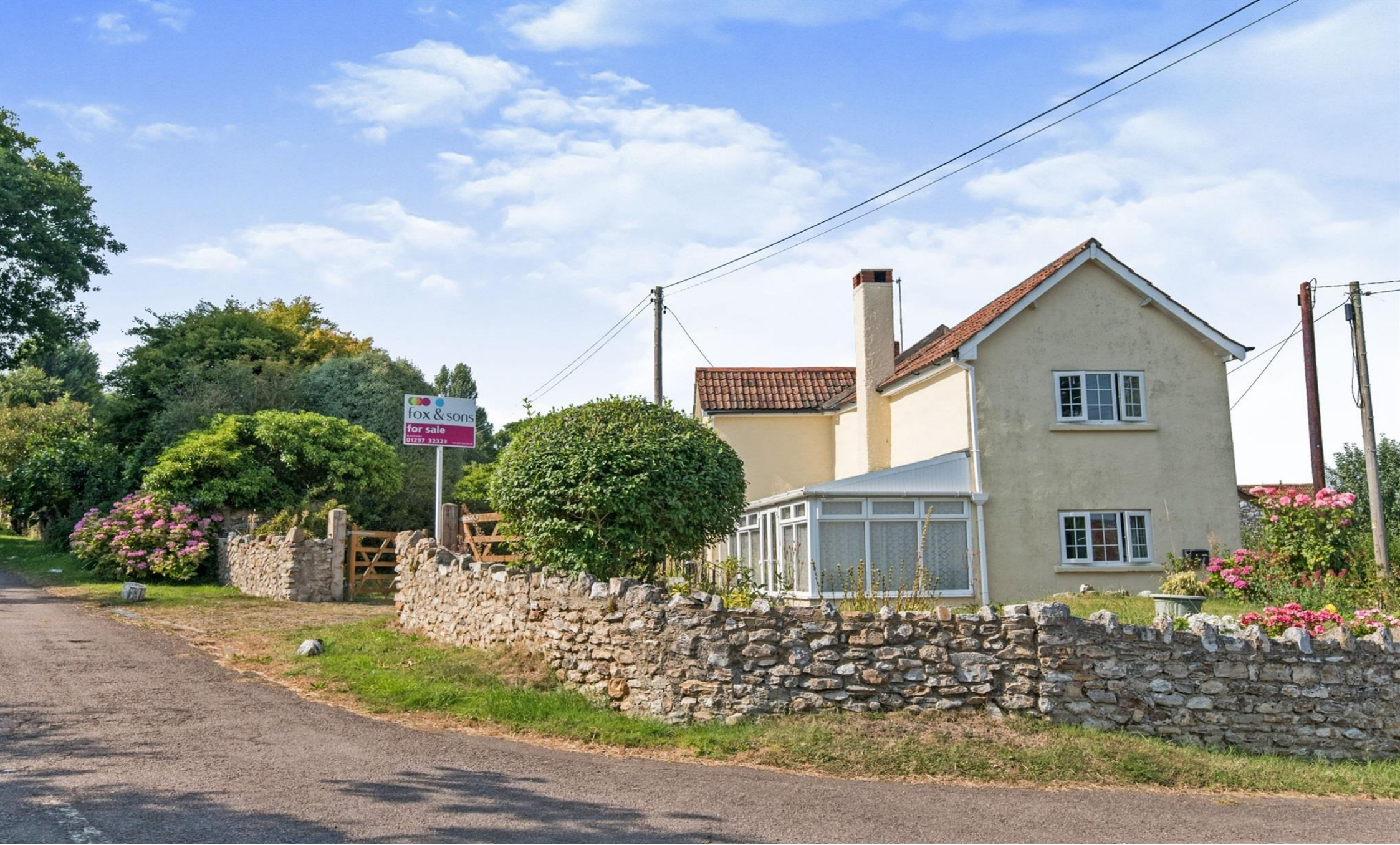
Rose Cottage Ham, Axminster EX13 7HL