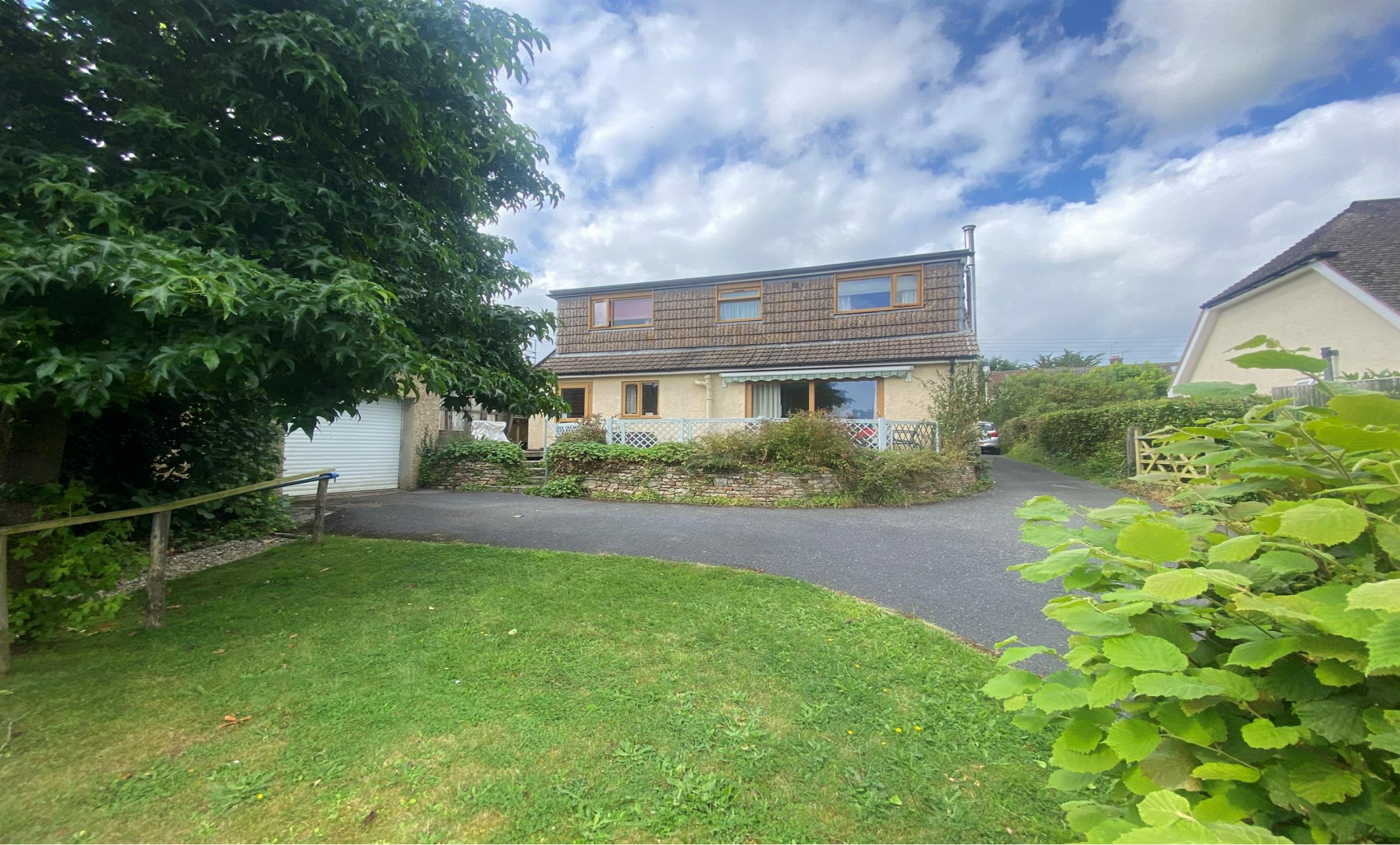
Hazel Bank, The Street, Kilmington, Axminster EX13 7SP