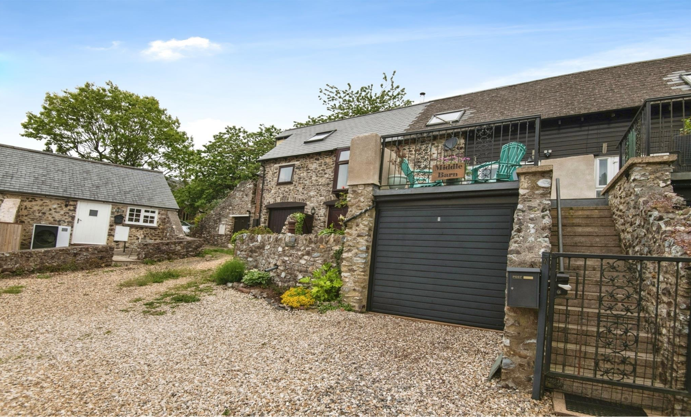
Middle Barn, Dunkeswell, Honiton EX14 4QZ