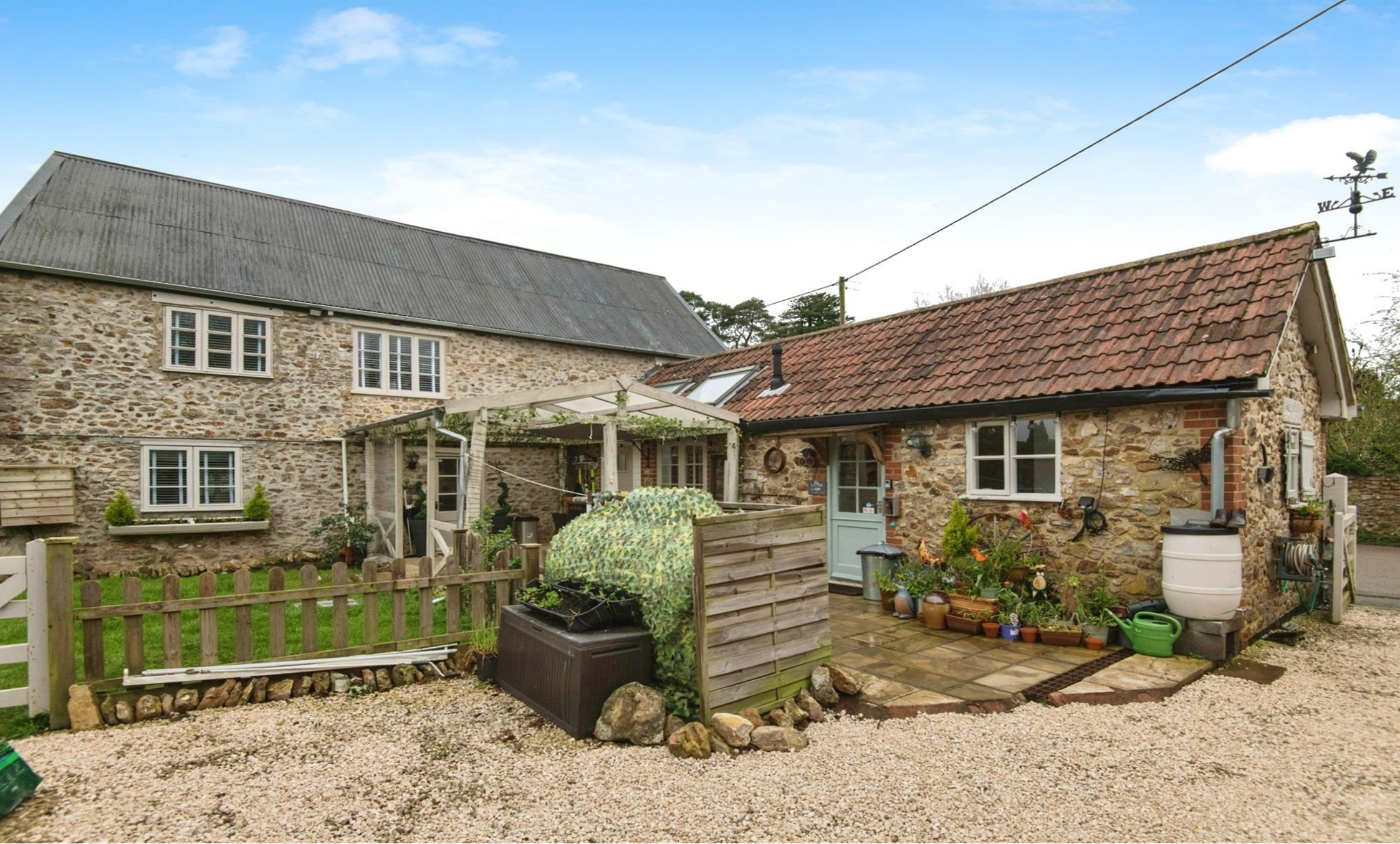
The Tuckers Lodge, Dalwood Axminster EX13 7EG