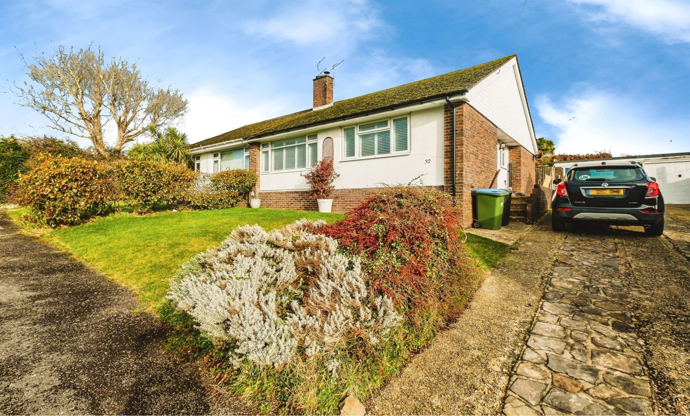
Beech Road, Findon Worthing BN14 0UR