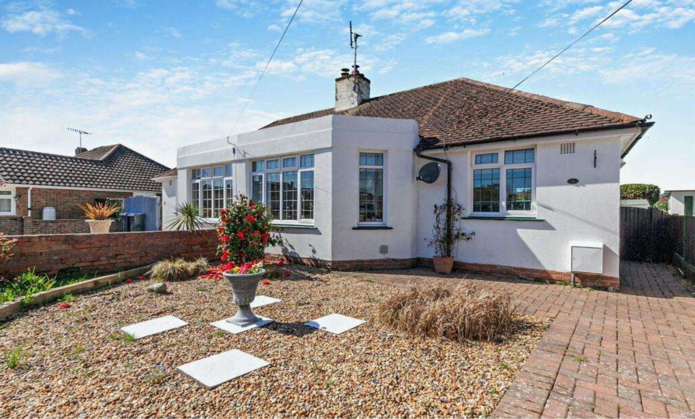
Sackville Crescent, Worthing BN14 8BP