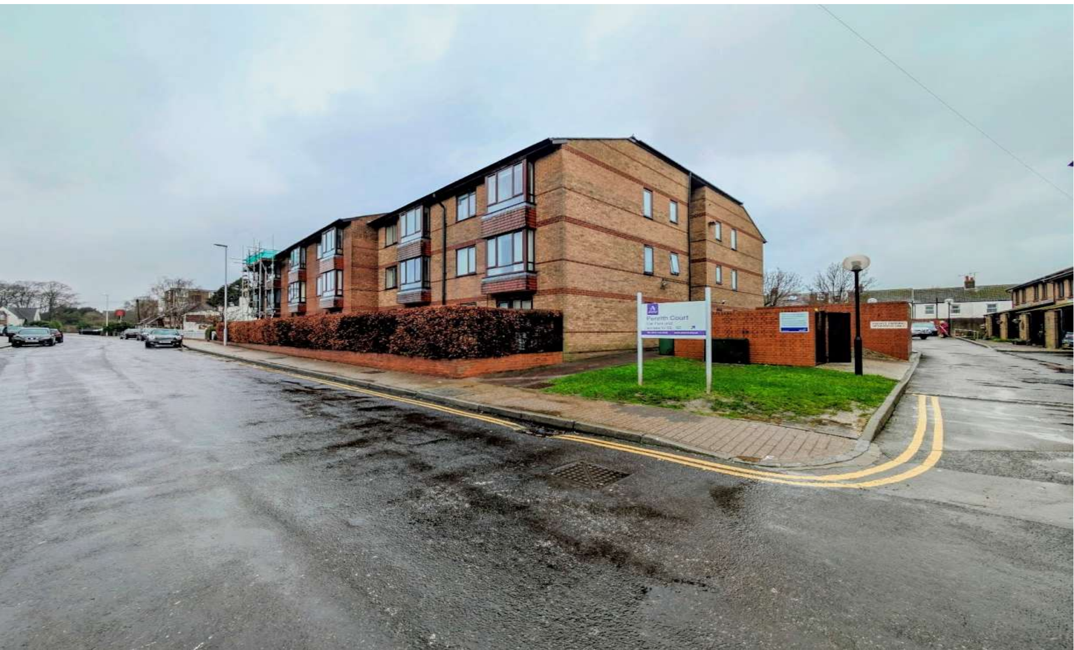
Penrith Court Broadwater Street East, Worthing BN14 9AN