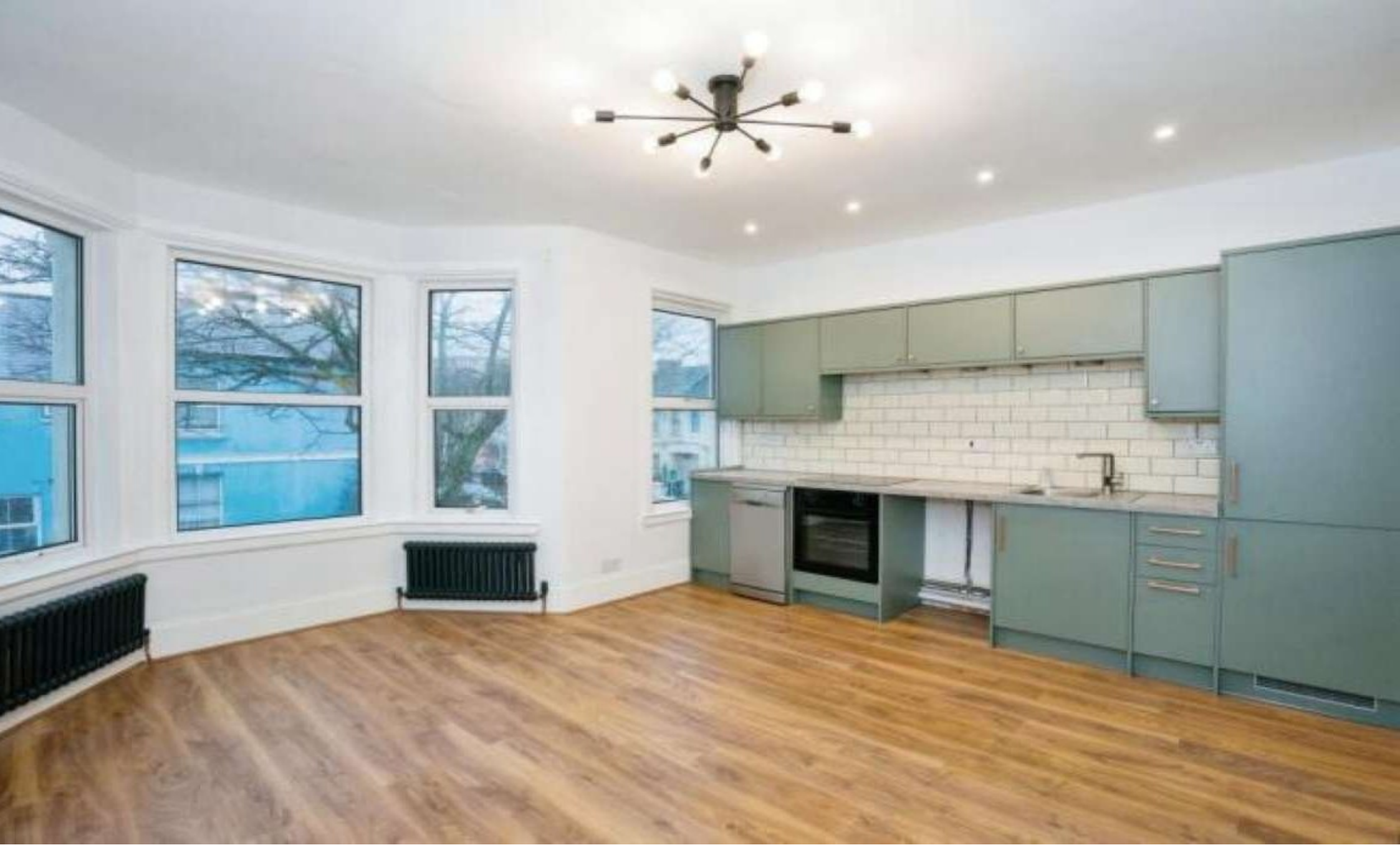
Top Flat Ashdown Road, Worthing BN11 1DE