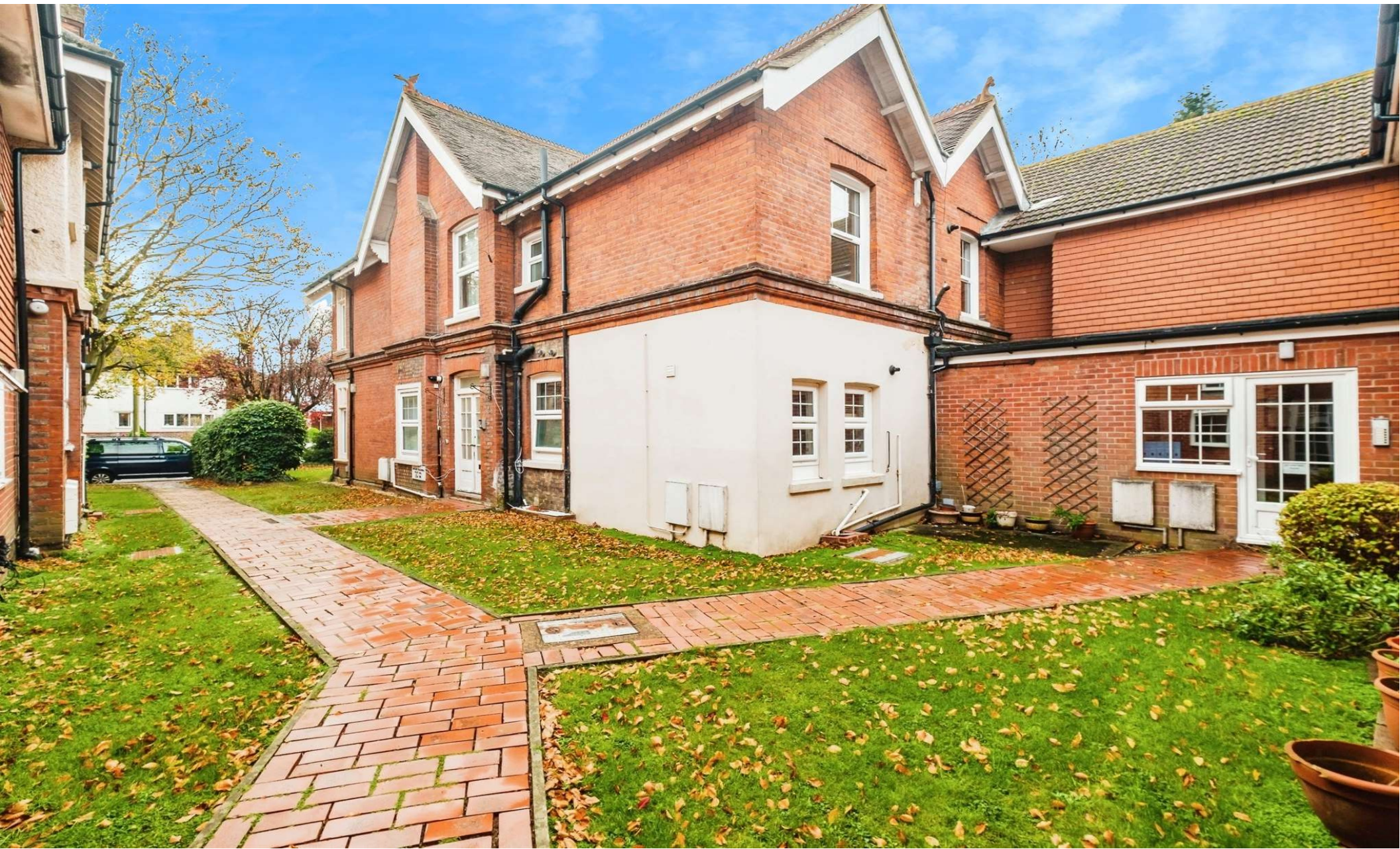
Loxley Gardens Bulkington Avenue, Worthing BN14 7JB