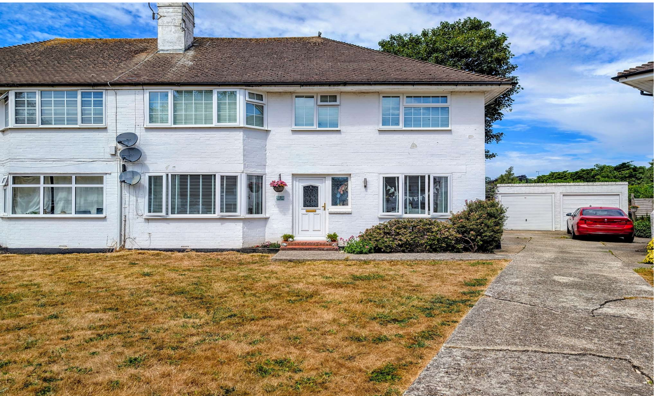
Shirley Close, Worthing BN14 9BA