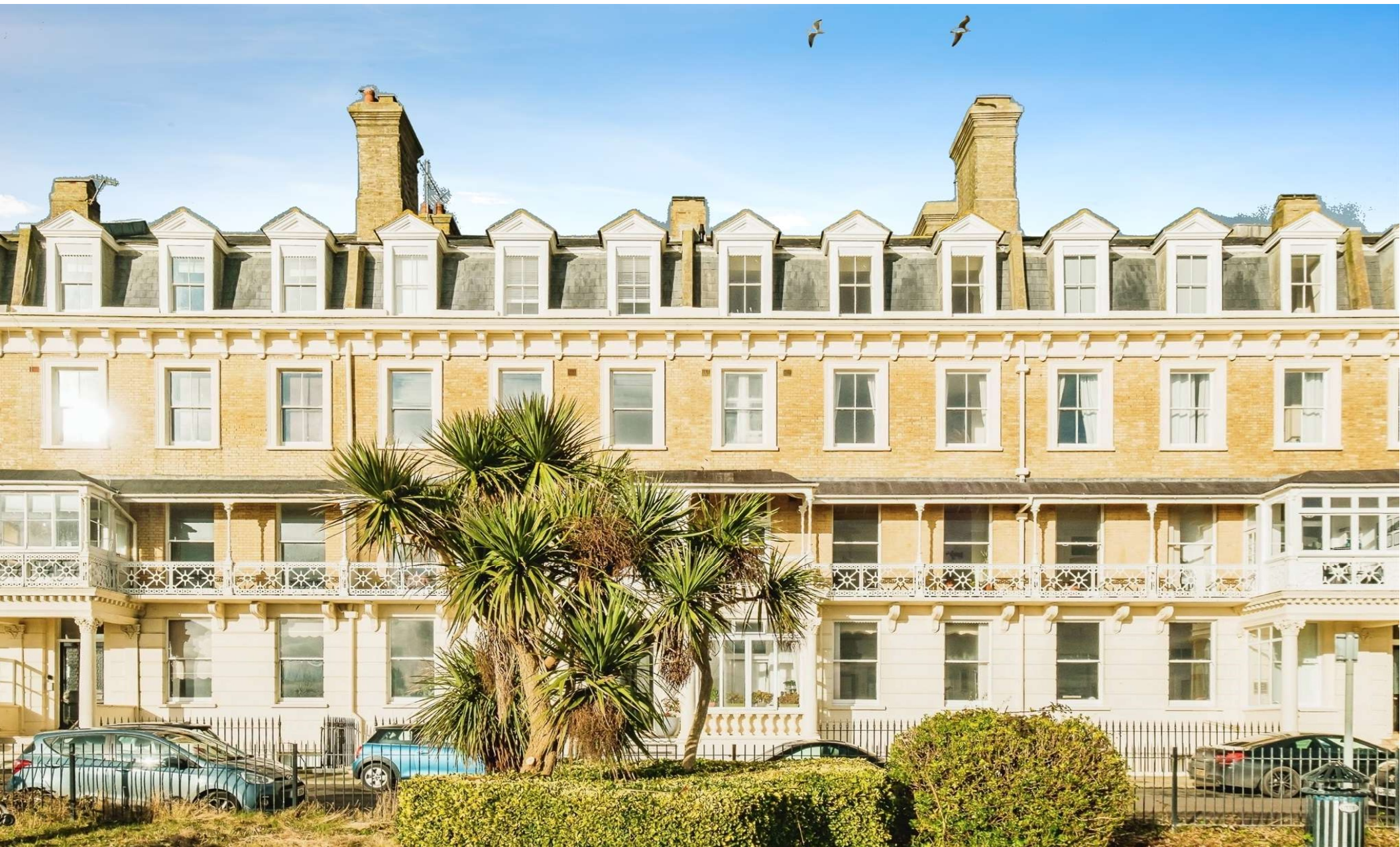
Heene Court Mansions Heene Terrace, Worthing BN11 3NW