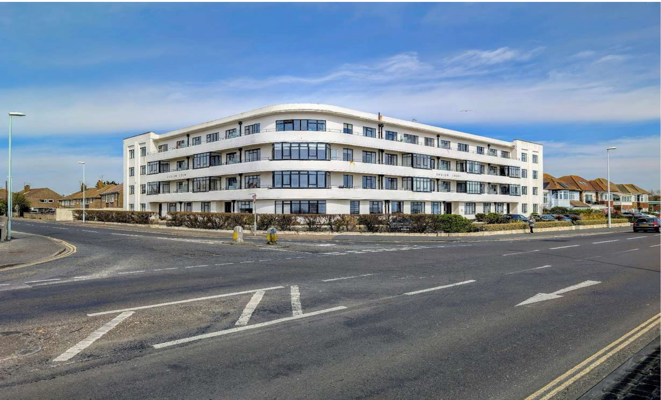
Onslow Court Brighton Road, Worthing BN11 2PL