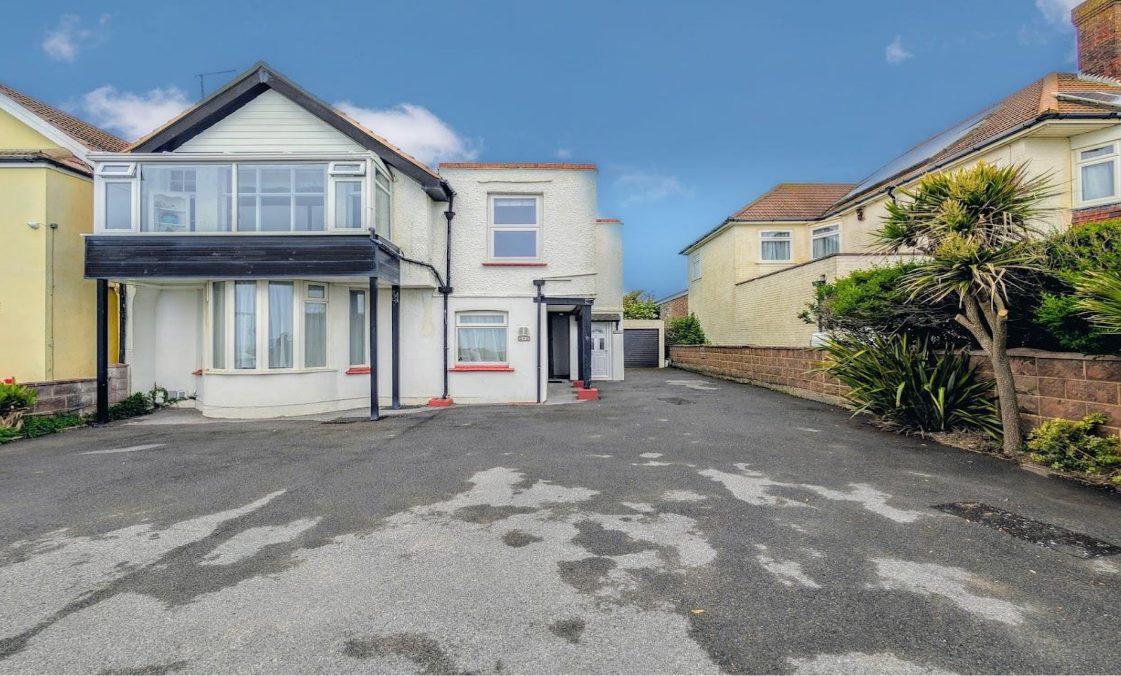
Brighton Road, Worthing BN11 2HG