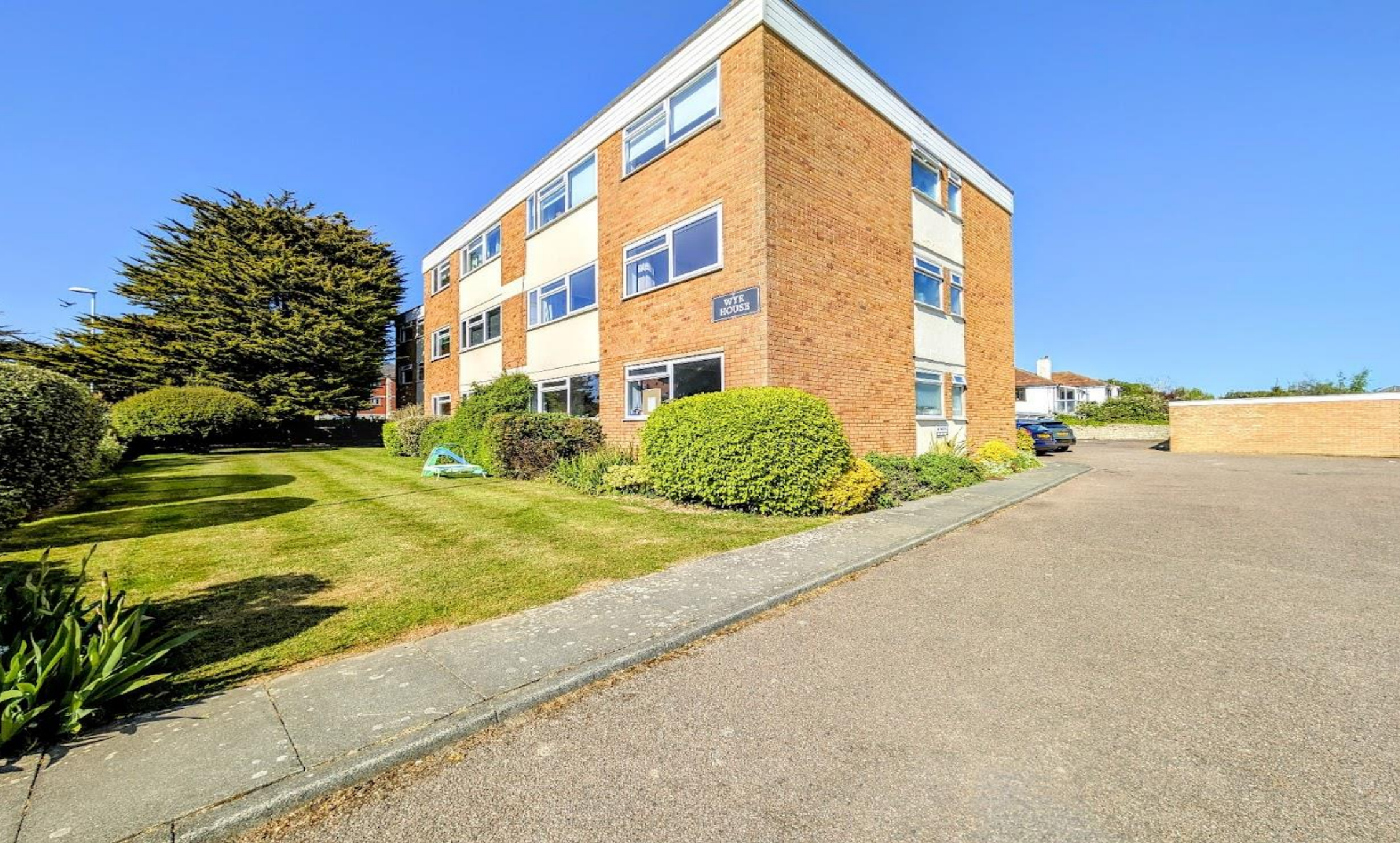
Wye House Downview Road, Worthing BN11 4QS