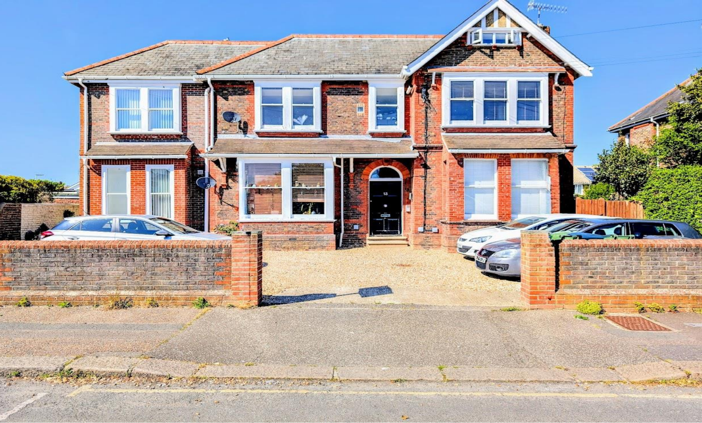
Langton Road, Worthing, BN14 7BY