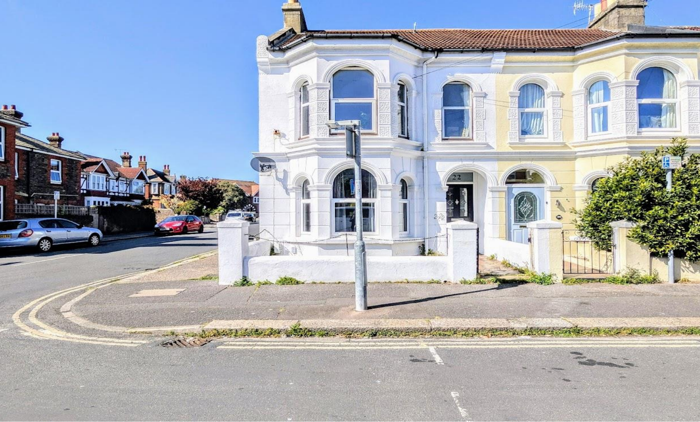
Bridge Road, Worthing, BN14 7BU