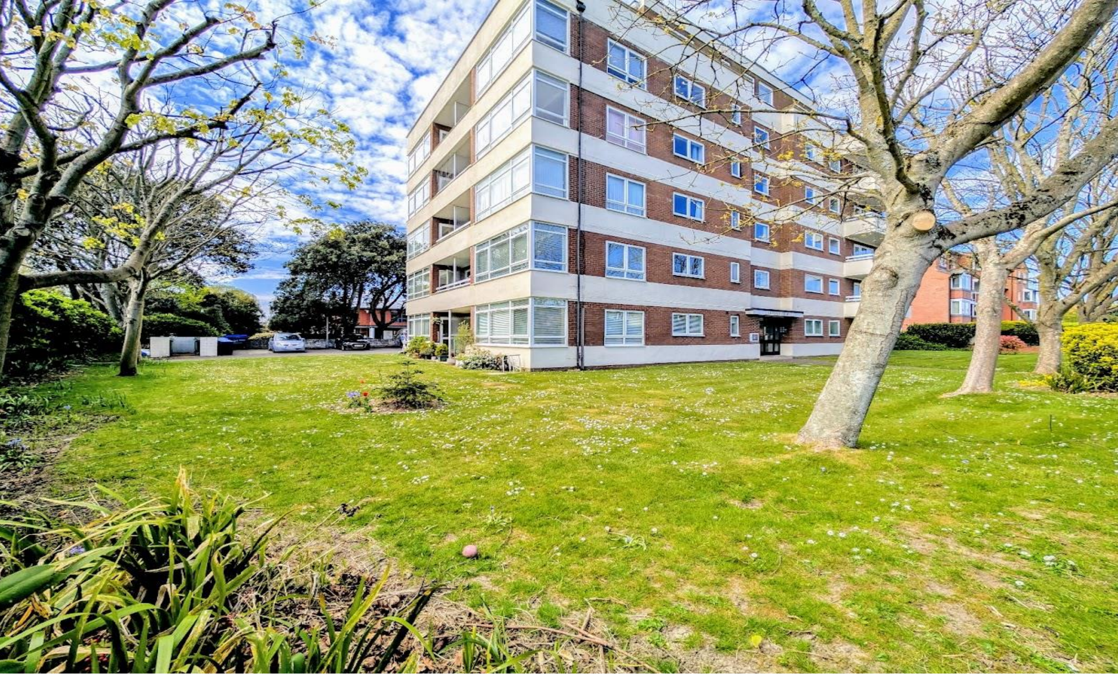
Airedale Court Heene Road, Worthing BN11 4LH