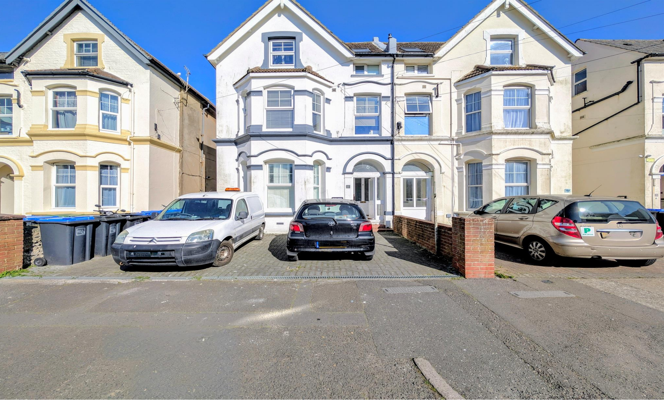
Queens Road, Worthing BN11 3LX