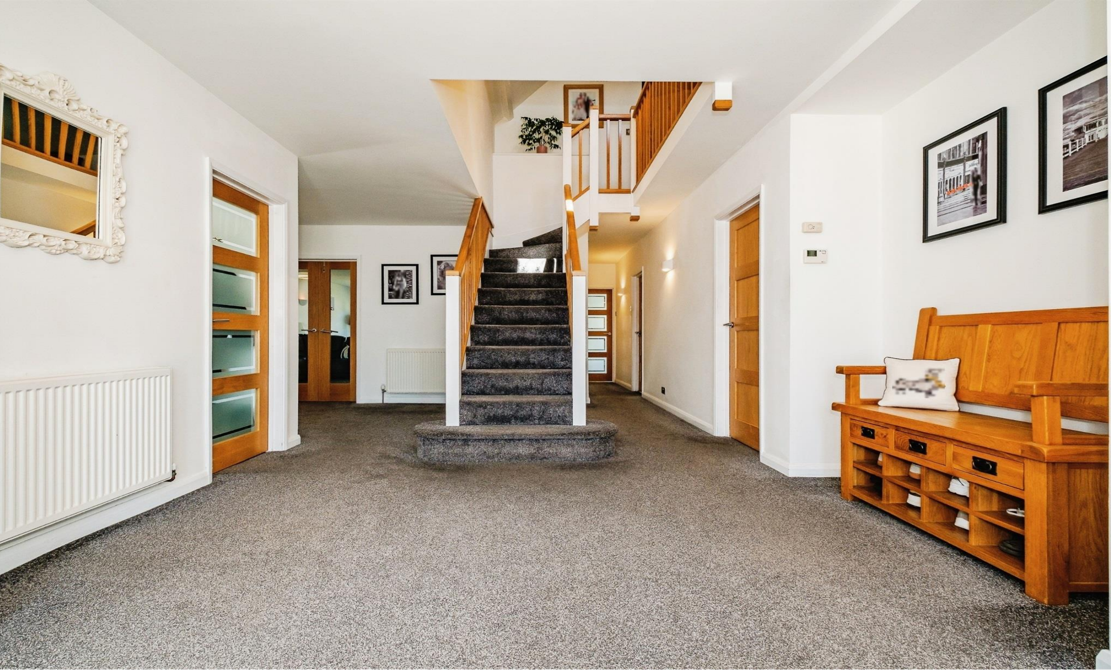
Poulters Lane, Worthing BN14 7SP