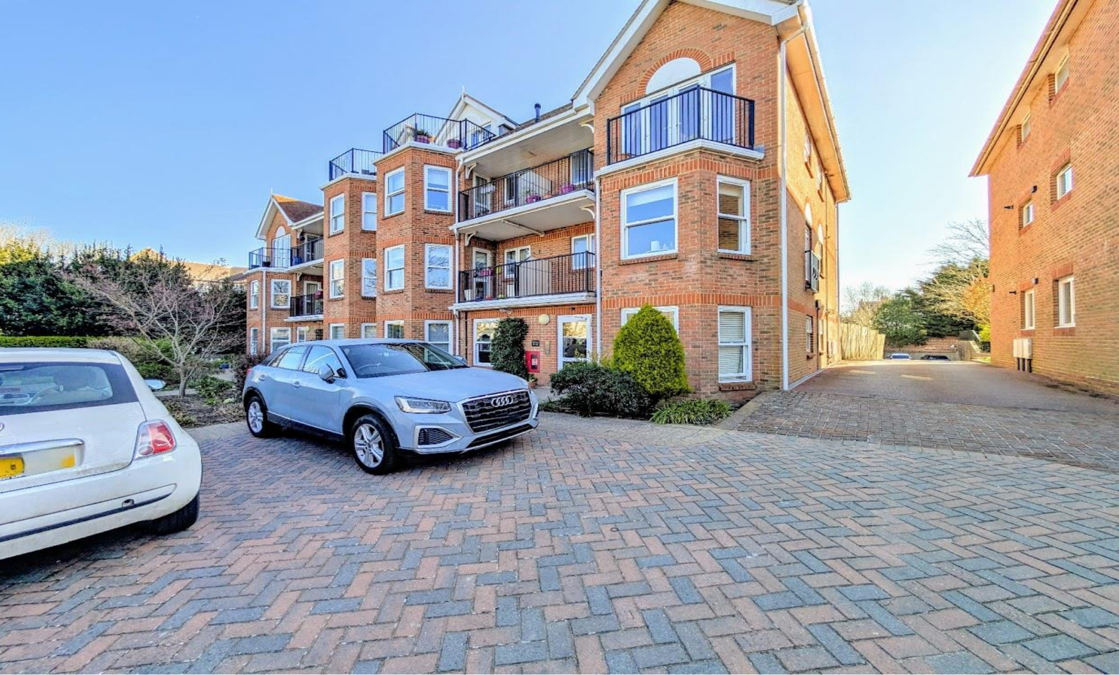
Chatsworth Lodge St. Botolphs Road, Worthing BN11 4JE