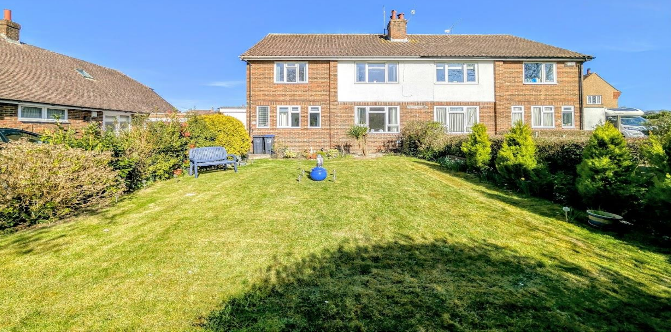
Findon Road, Worthing BN14 0HB