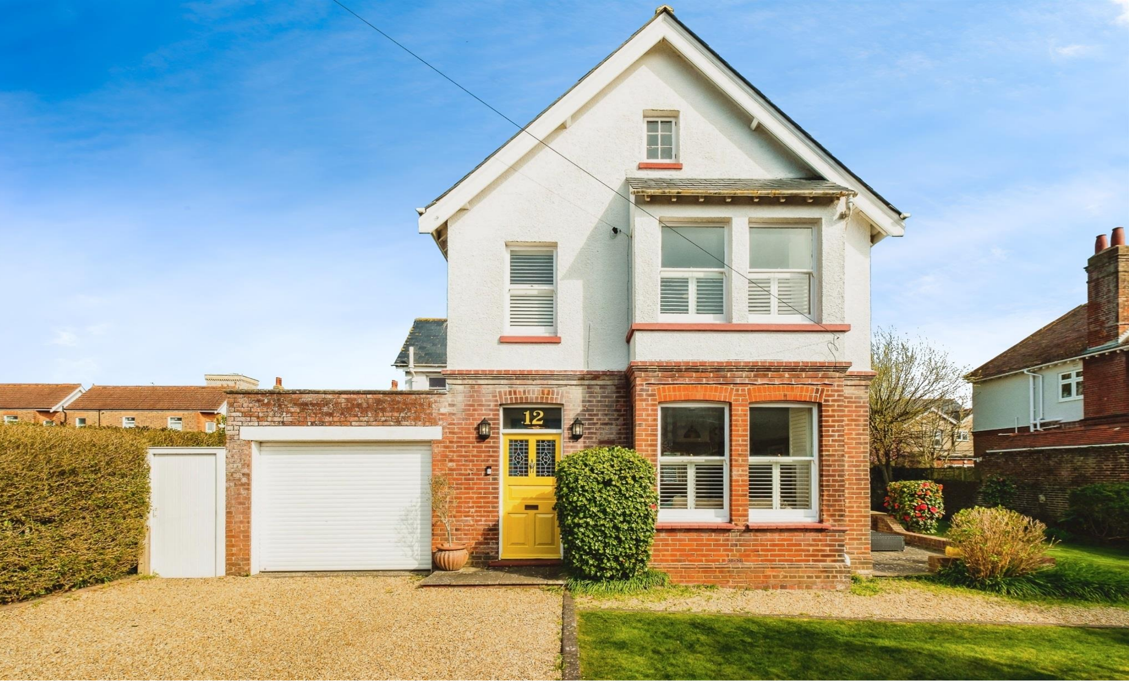
Westbrooke, Worthing BN11 1RE