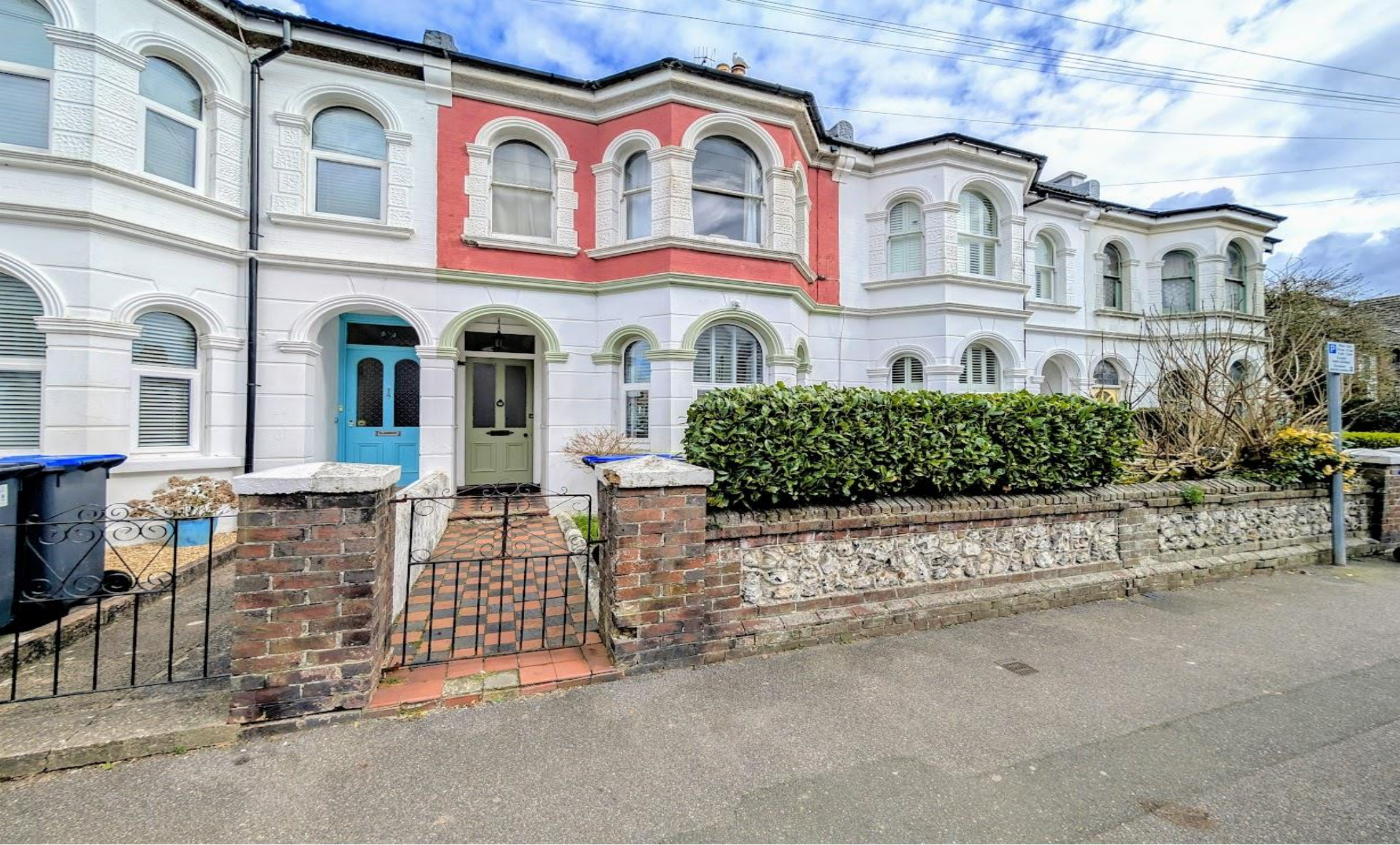
Eastcourt Road, Worthing BN14 7DA