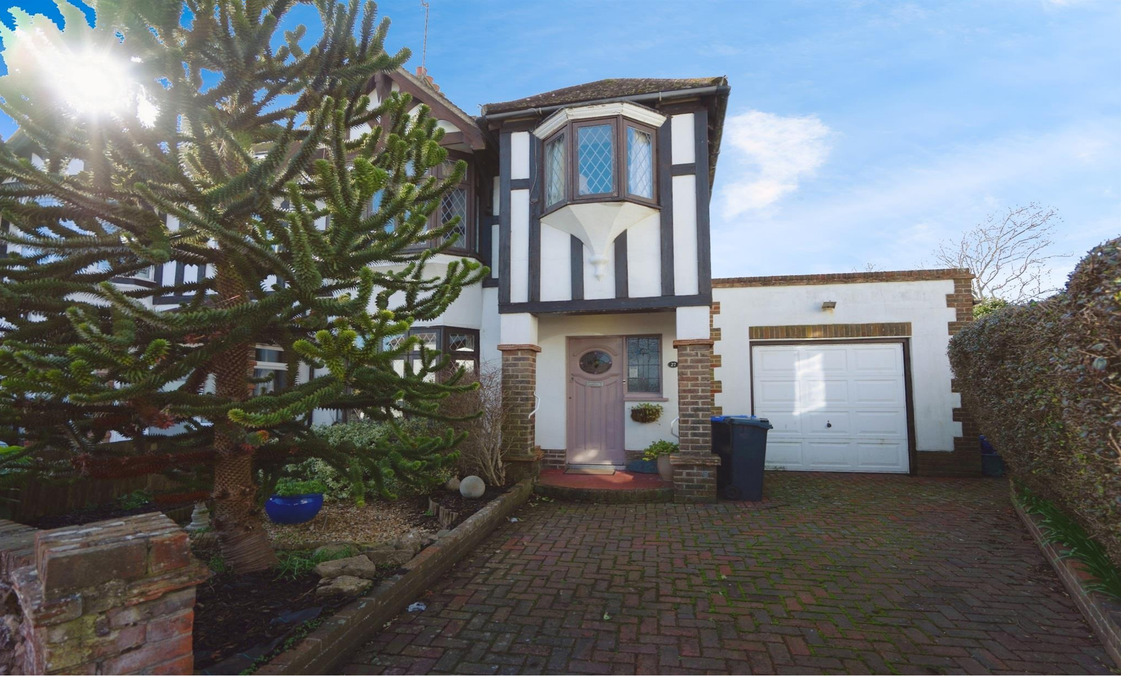
Heatherstone Road, Worthing BN11 2HD