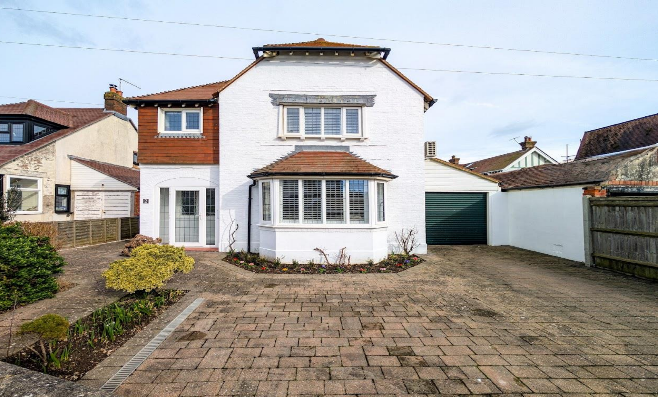
Ophir Road, Worthing BN11 2SR