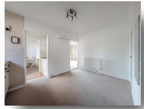
Vale Dr Hillinew Rd