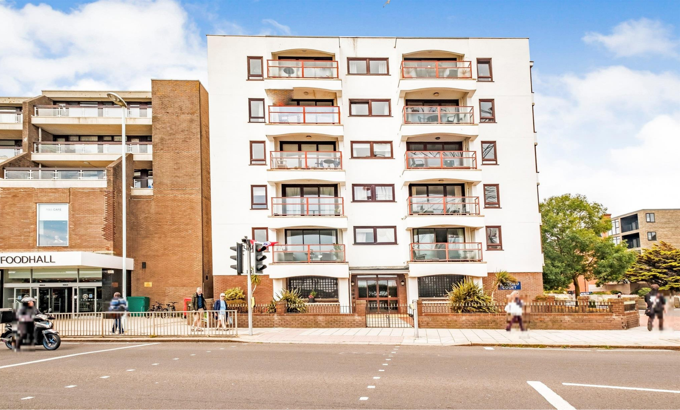
Beaulieu Court Marine Parade, Worthing BN11 3QZ