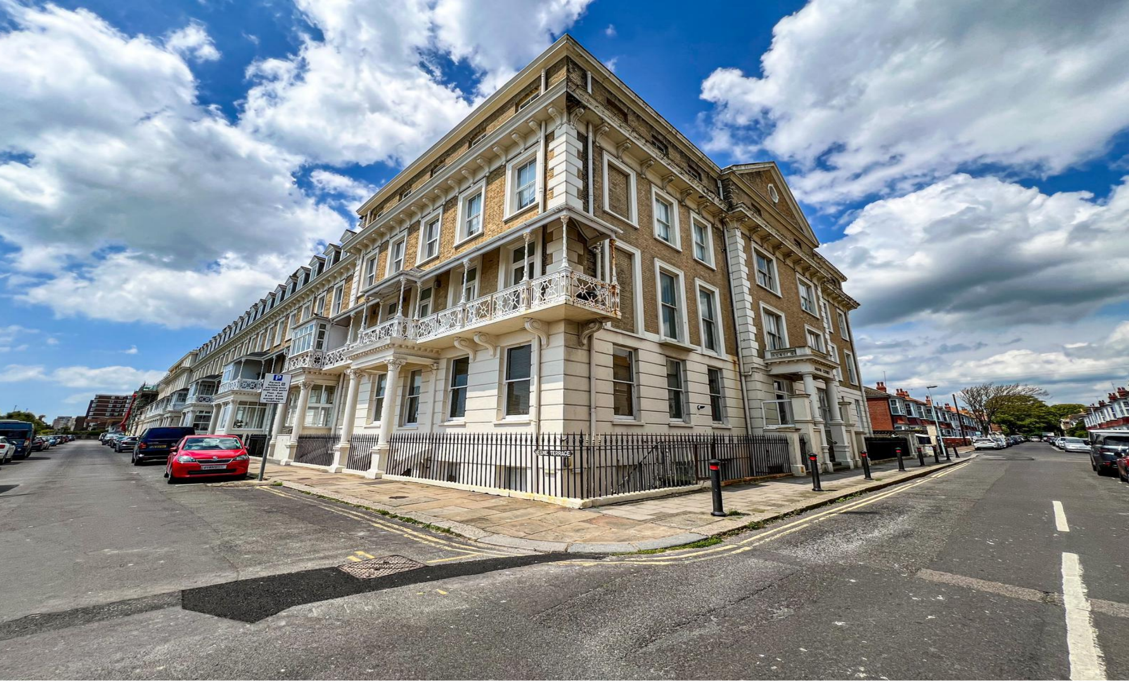
Jason Court Heene Terrace, Worthing BN11 3LQ