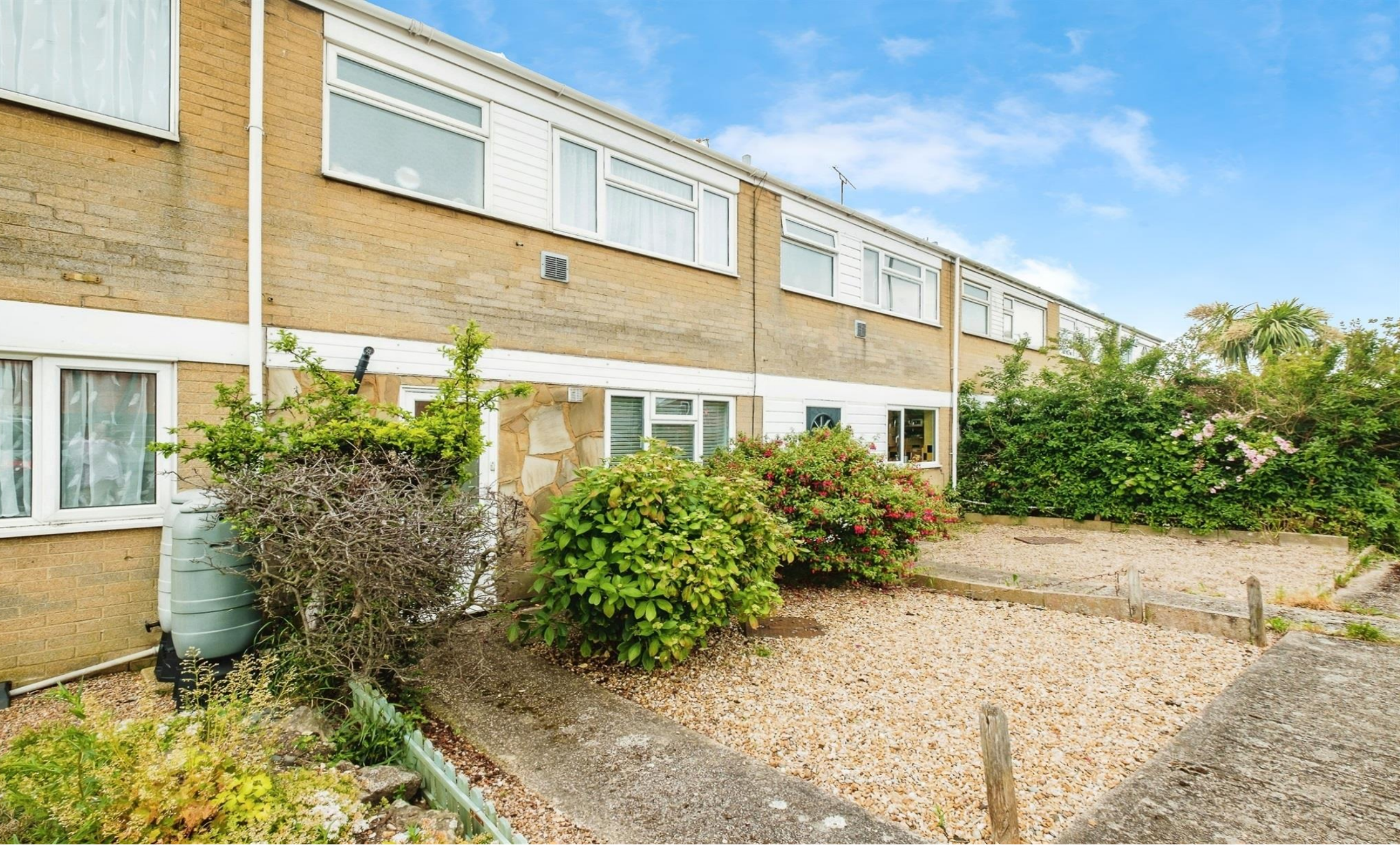
Downlands Gardens, Worthing BN14 9EZ