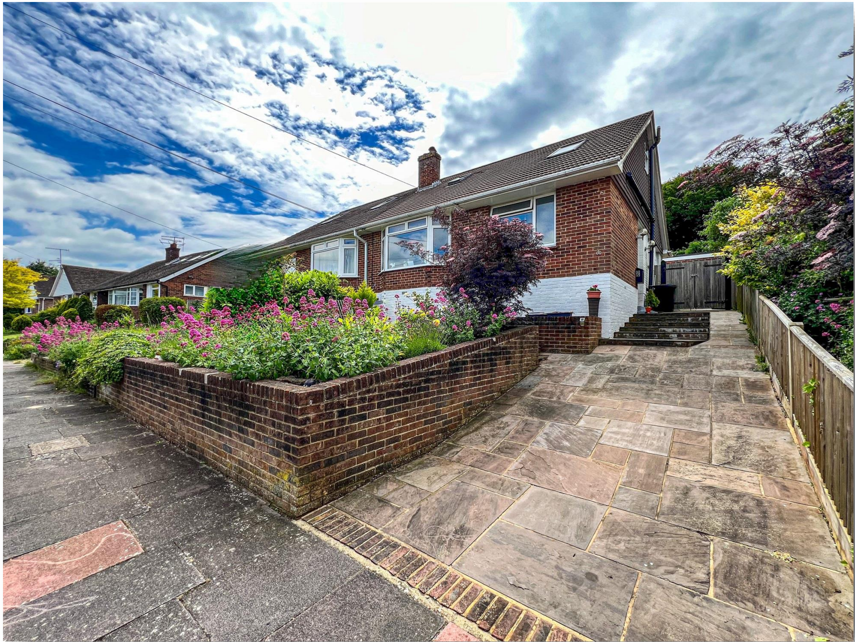
Parham Road, Worthing BN14 0BN