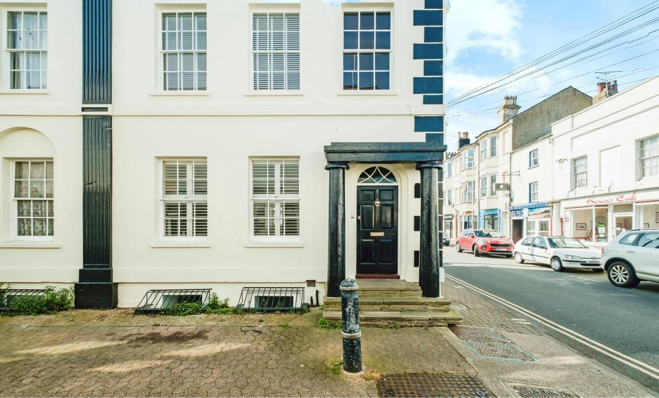
Caledonian Place, Worthing BN11 3DB