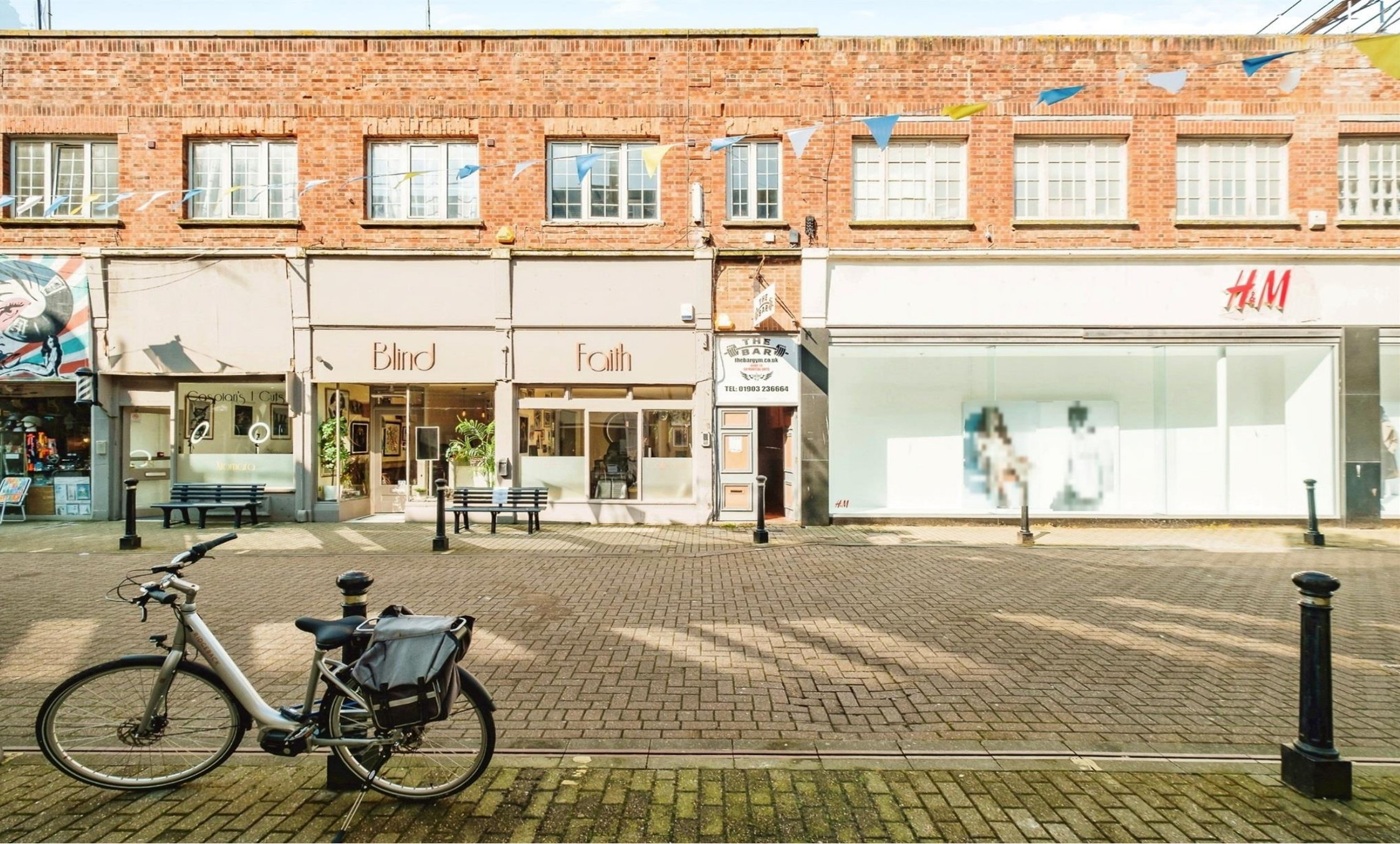
Flat C Bath Place, Worthing BN11 3BA