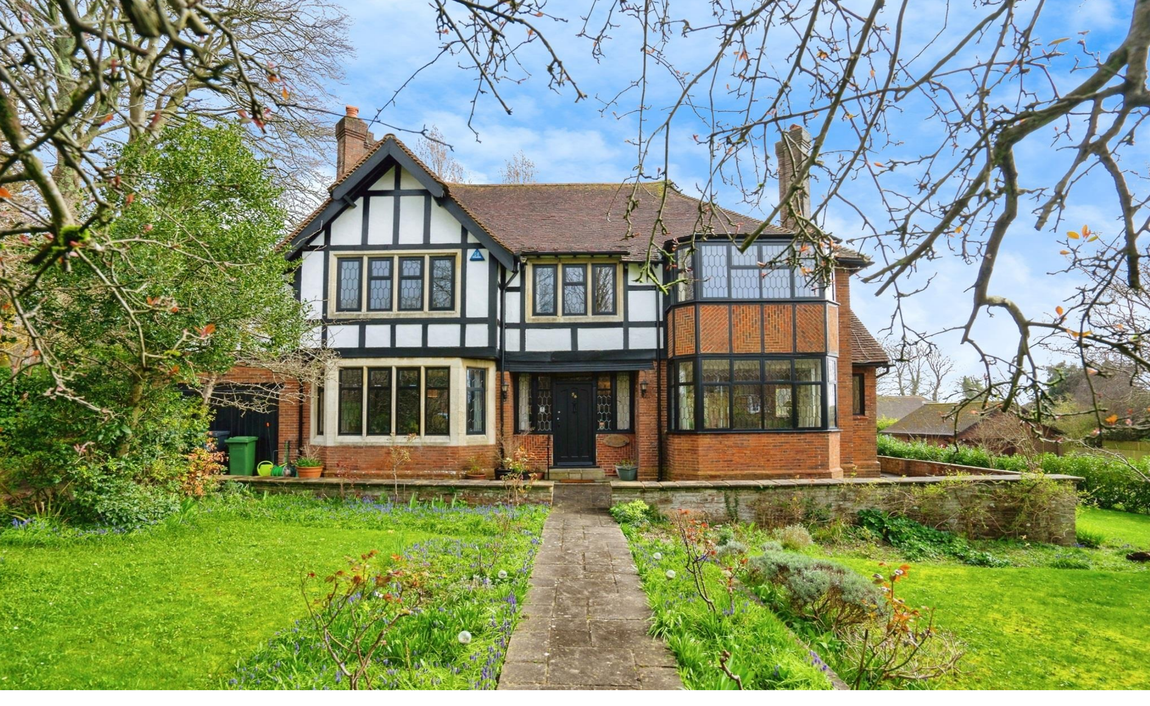
First Avenue, Worthing BN14 9NP